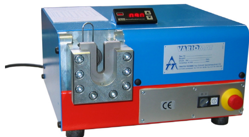
VARIOMAT with cutting ring assembly unit

Combined tube working device for cutting ring assembly and flaring