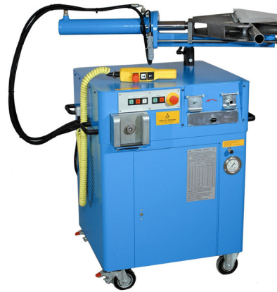
PB 42 plus