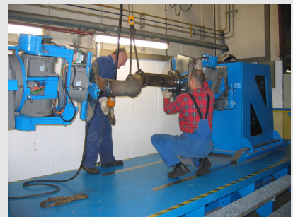
... then the template pipe is inserted ...