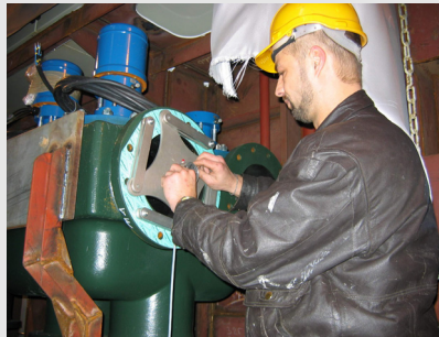
Installation of the flange adapters.