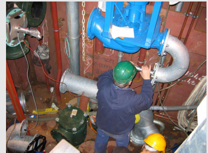
The SCOPELINK elements are ...