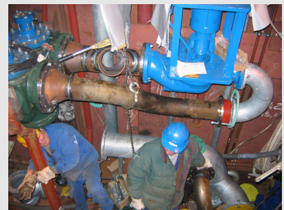
It can be inserted at perfect fit.