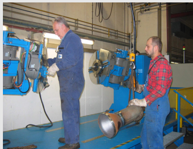
... are mounted to the ROBOFIX, ...