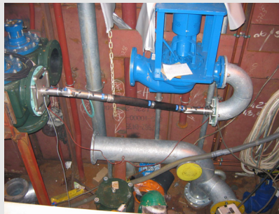
About 15 min. later: Finished.