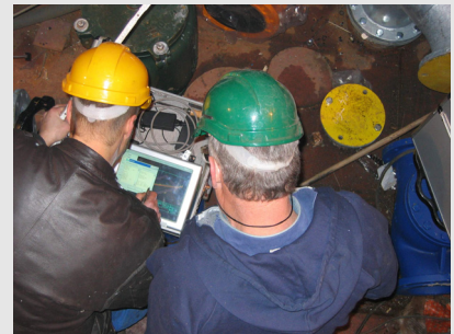
Isometric sketching via Laptop.