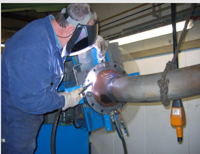
... and spot-welded to the flanges.