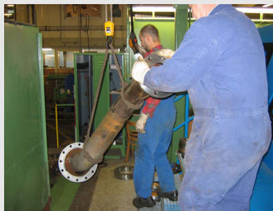
The pipe is transported to the site.