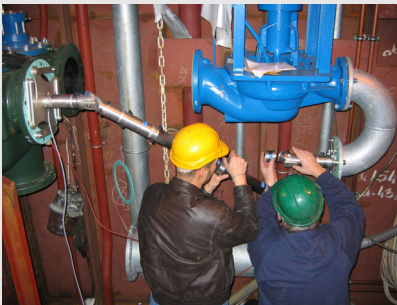
... inserted from outside to inside.